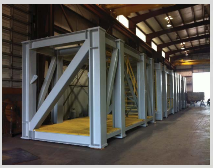
Crane Support Trusses